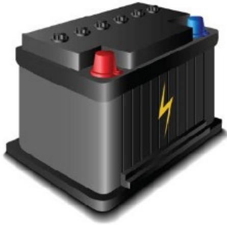
CAR BATTERY/BATTERIE DE VOITURE